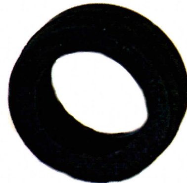
Rubber Skate Wheel Cover

Sizes: Standard 1.93 inch skate wheels. Wheel dia. 2.060625 X .75 width. 100 LBS.