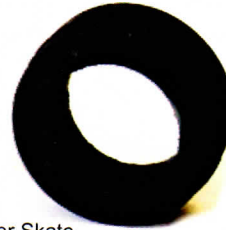
Rubber Skate Wheel Cover