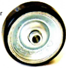
PVC Skate Wheel Cover